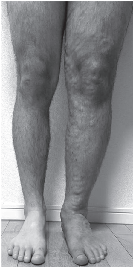
Figure 1. Edematous left lower extremity.

Differential diagnosis of chronic edema of the lower extremities includes lymphedema, myxedema, renal insufficiency, heart insuf-