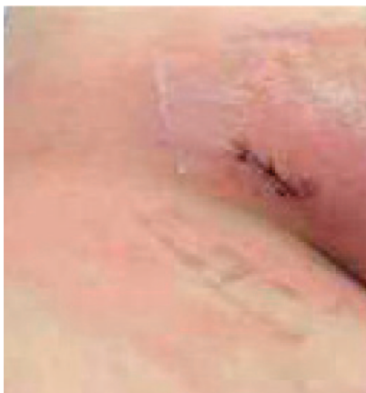
Figure 1. A reddish 4×4.5 cm mass above the right inguinal ligament with concurrent cellulitis was present.

Based on clinical findings, (a) and (e) were the two most prominent diagnoses. Superficial inguinal lymphadenitis and acute appendicitis