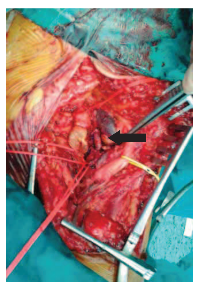
Figure 3. The arrow shows the autologous interposition graft.

Every symptomatic popliteal aneurysm must be repaired. The indication for asymptomatic aneurysms is somewhat controversial. Most authors recommend intervention once the diameter reaches 2 or 2.5 cm.