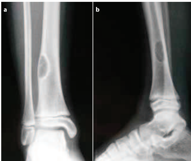
Figure 1a, 1b. Anteroposterior and lateral X-rays of right distal tibia. An eccentric cortical lesion with sclerotic margins is noted.

An 11-year-old boy presented to the Emergency Department of our hospital complaining for acute right lower limb pain. No history of trauma was mentioned. Physical examination revealed local tenderness just above the right ankle. X-rays showed a focal lucent cortical lesion with sclerotic lesions at the distal diaphysis of right tibia (figures 1a, 1b). A focused low dose computed tomography (CT) scan was performed in order to define the nature of this focal lesion (figures 2a, 2b). A cortical lesion (sized 27×15 mm) with sclerotic lobulated margins (internal scalloping) with no periosteal reaction or cortical lysis was observed, imaging findings consistent with nonossifying fibroma (NOF). The boy also underwent a magnetic resonance imaging (MRI) exam in a private diagnostic medical center (figures 3a, 3b, 3c).