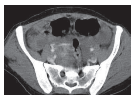
Figure 4 Figure 5 Figure 6