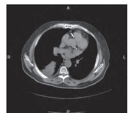
Figure 1 Figure 2 Figure 3