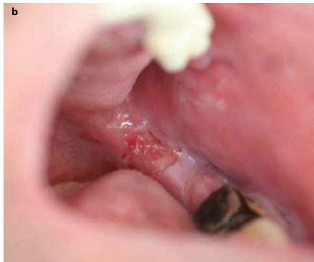
Figure 1. Ulcerative lesion in the right (a) and left (b) retromolar area during first clinical examination.