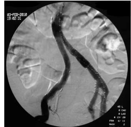
Figure 4. Completion angiogram demonstrating complete exclusion of the bilateral iliac aneurysms, with maintenance of blood flow to the left IIA via the IBD device, coil embolization of the right IIA and extension of both limbs to the external iliac artery, with no endoleak.

occlusion is usually considered as mild and transient, half of the patients remain symptomatic and are sufficiently debilitated.